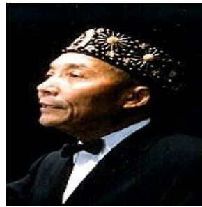
The Honorable Elijah Muhammad Messenger Of Allah

We who follow the teachings of the Honora-